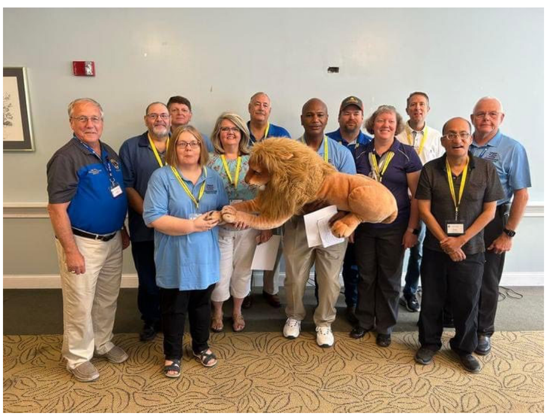
From the Community