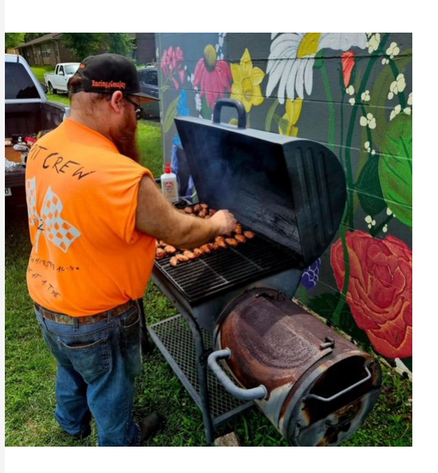
Basehor Lions Wings Cook-Off (July 2023)

Send your action photos to <a href="mailto:174newsletter@gmail.com">174newsletter@gmail.com</a> by the 25th of each month to be included in next month's newsletter.