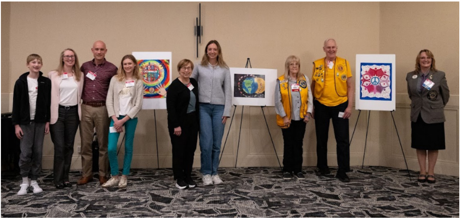
Peace Poster Winners Awarded