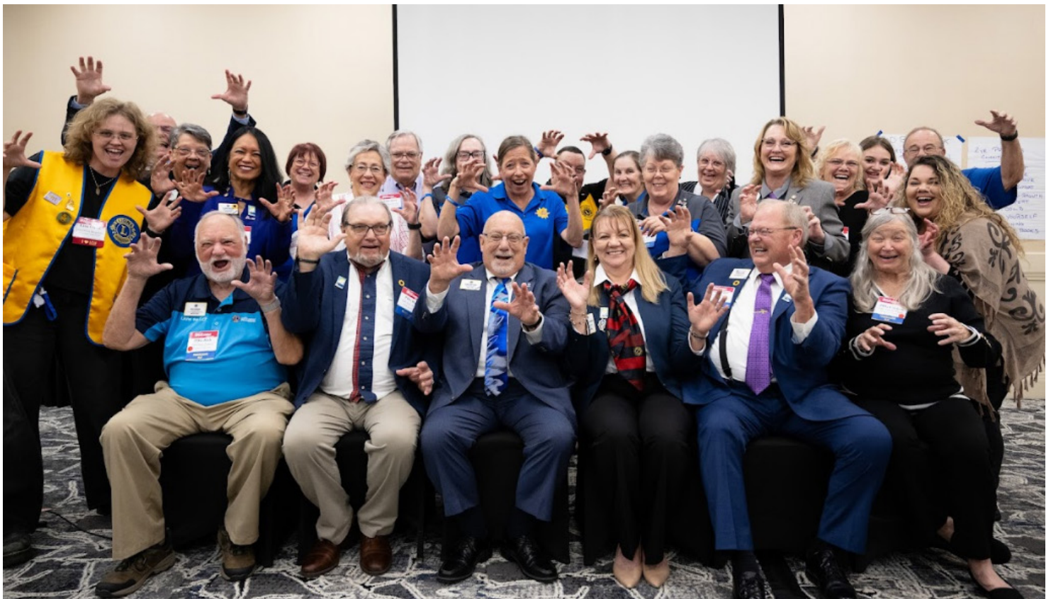
Graduates of the Certified Guiding Lions Training and Facilitators! Roar Lions!