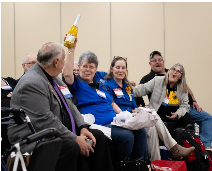
Fun at the PDG Pound Auction