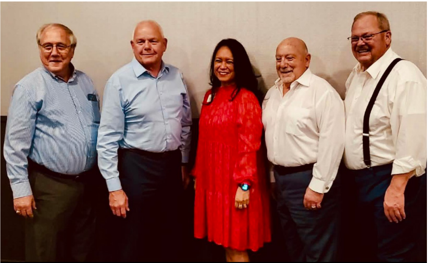
Five PIDs in one place - Saturday Night after the Awards Banquet - some extra time to socialize!