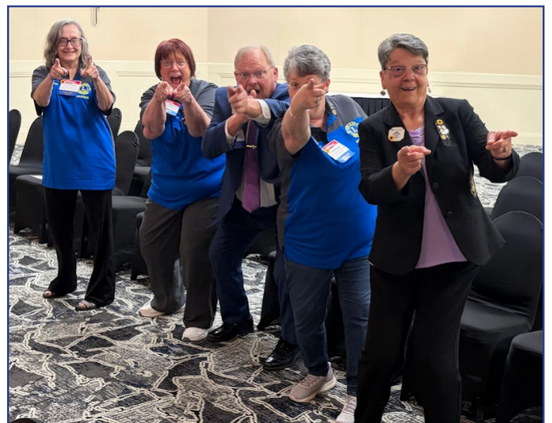
Stretch and movement during the Guiding Lions Training