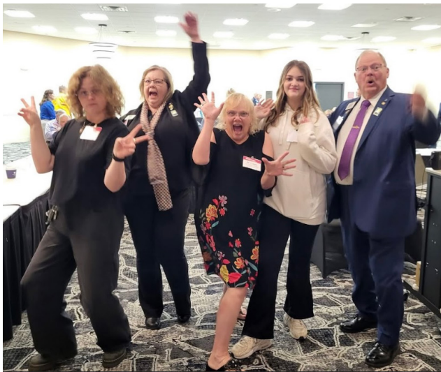
Learning can be Fun! Look at these Lions!