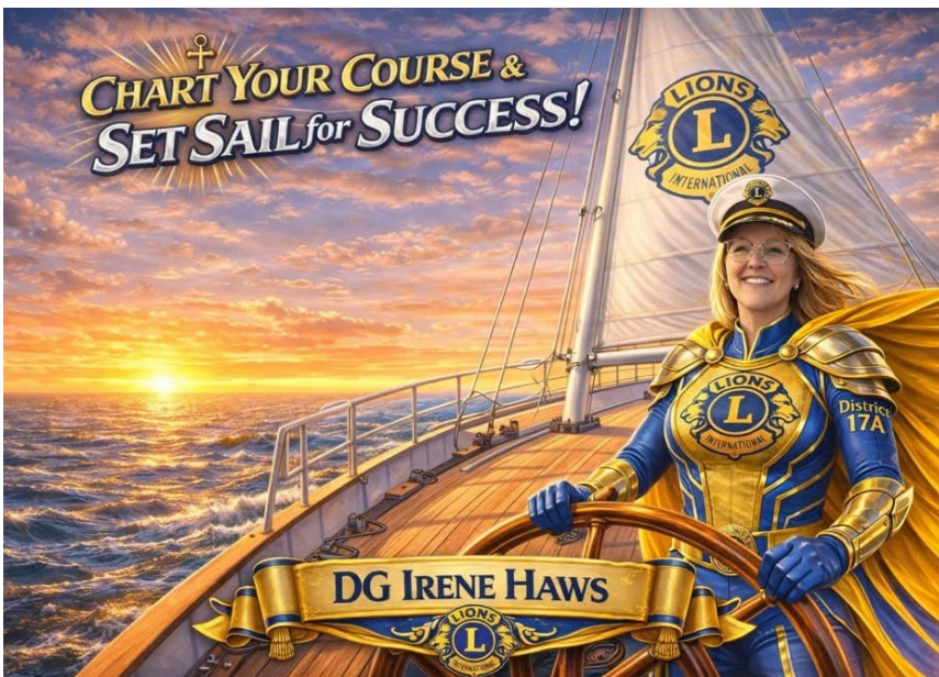
Saturday Night's Keynote address included use of AI in this illustration.